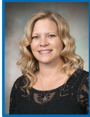
Starr Ginn Armstrong Flight Research Center